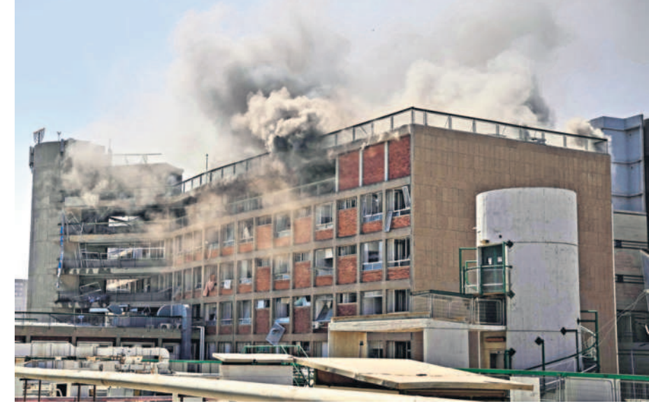
Smokes raises from a building of the Soroka hospital complex after it was hit by a missile fired from Iran, in Be'er Sheva, Israel, on Thursday.

In the aftermath of the strikes, Israeli Defence Minister Israel Katz blamed Iran's Supreme Leader Ayatollah Ali Khamenei and said the military "has been in-structed and knows that in order to achieve all of its goals, this man absolutely