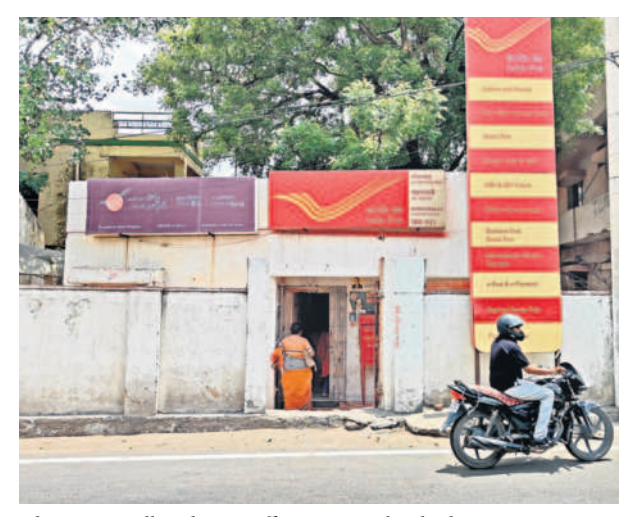
The Bowenpally sub-post office in Secunderabad Cantonment.