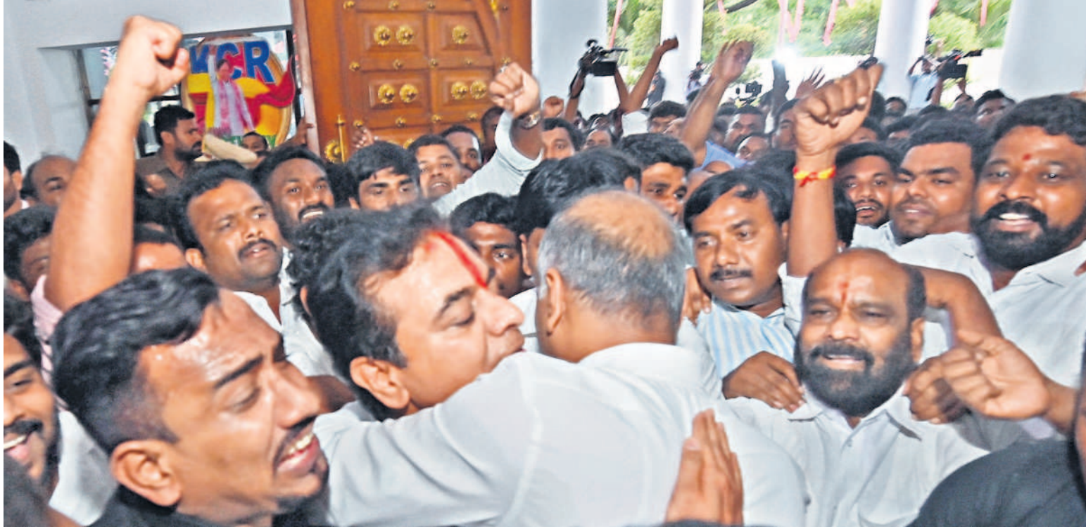
BRS working president KT Rama Rao gets a rousing welcome by party leaders and activists at Telangana Bhavan after ACB questioning.

SAYS FORMULA-E RACE CASE A DIVERSIONARY TACTIC DEPLOYED BY REVANTH