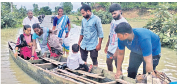
Two pregnant women being shifted to a safer place in Bejjur in 2024.

Officials warned that these women may face difficulties accessing nearby primary health centres or sub-centres