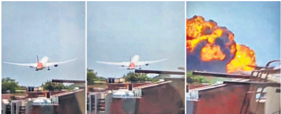
The London-bound Air India plane is seen losing altitude soon after take-off and crashing into a medical college complex, in Ahmedabad on Thursday.