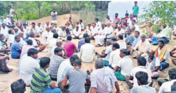
Pedda Dhanwada villagers holding a meeting as part of protest against the proposed ethanol plant.

"It could get delayed by a few days, but the ethanol plant will be established," he said, adding that the Centre was actively promoting ethanol units and the State government was facilitating the project "duly following Central government norms."