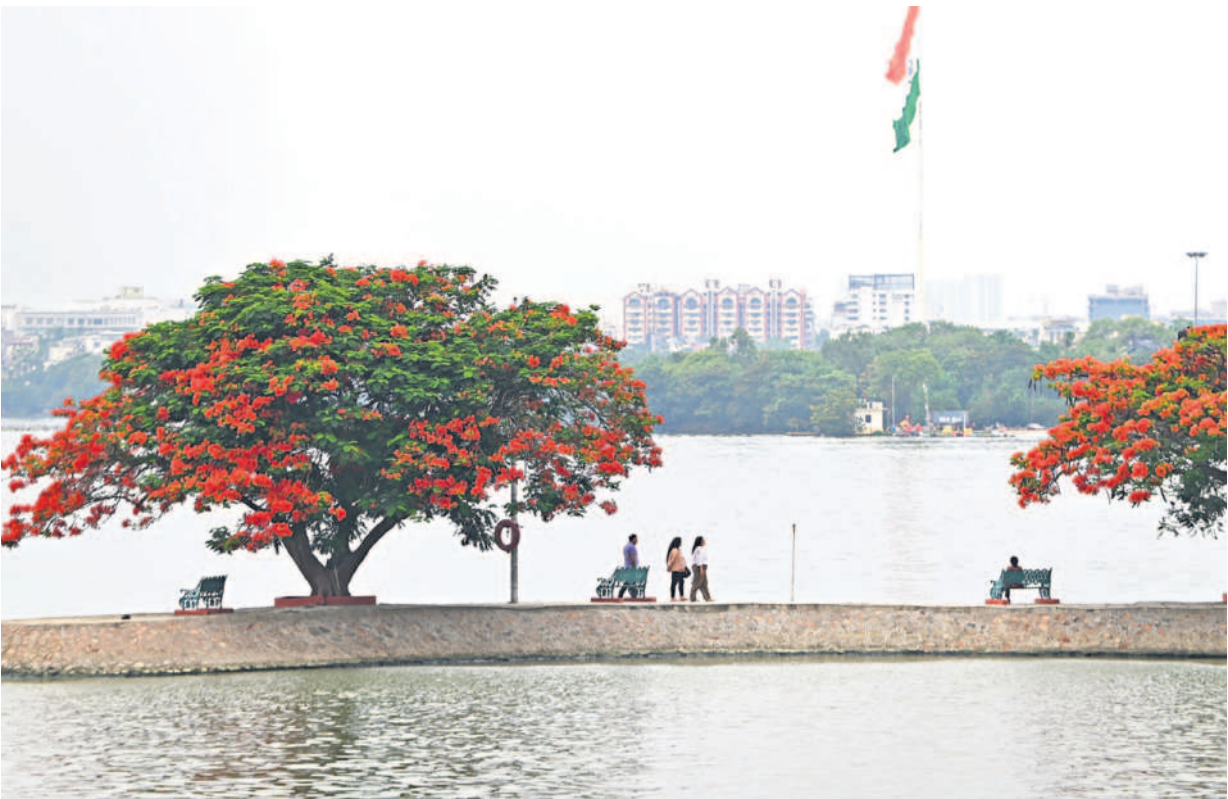
People take a stroll at Tank Bund as Hyderabad experiences overcast skies and cool breeze on Monday.

On Monday, IMD-H also forecast the possibility of light to moderate showers across several regions of the State, in addition to thundershowers. It indicated thunderstorms accompanied by lightning, gusty winds, and moderate showers likely at isolated places.