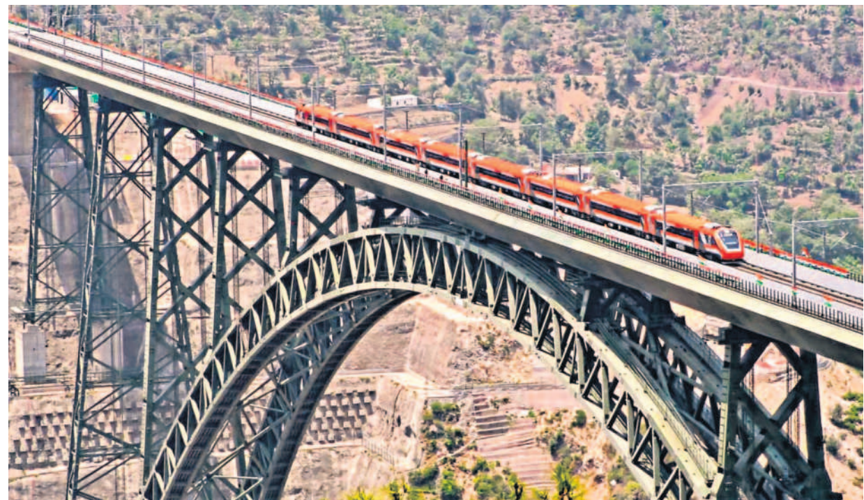
The Vande Bharat train, flagged off by PM Narendra Modi, crosses the Chenab rail bridge in Reasi district of J&K on Friday.