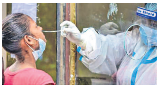
Overall caseload across the country has now reached 4,000 with two more infections reported in Telangana on Monday.

Such an exercise is vital to determine the prevailing virus strains and to understand their evolution in order to prepare for potential changes in severity and transmissibility. A coordinated effort to offer free