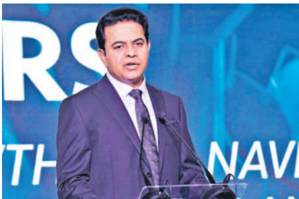
BRS working president KT Rama Rao delivering the keynote address at the Bridge India Week 2025 conference in London.

He projected Telangana as a global case study in sustainable growth, innovation and inclusive governance. "We have shown the world that remarkable transformation is possible with visionary leadership and people-centric policies," he said, delivering the keynote address on 'Why Telangana Matters: Steady Growth and Navigating the Global Eco-