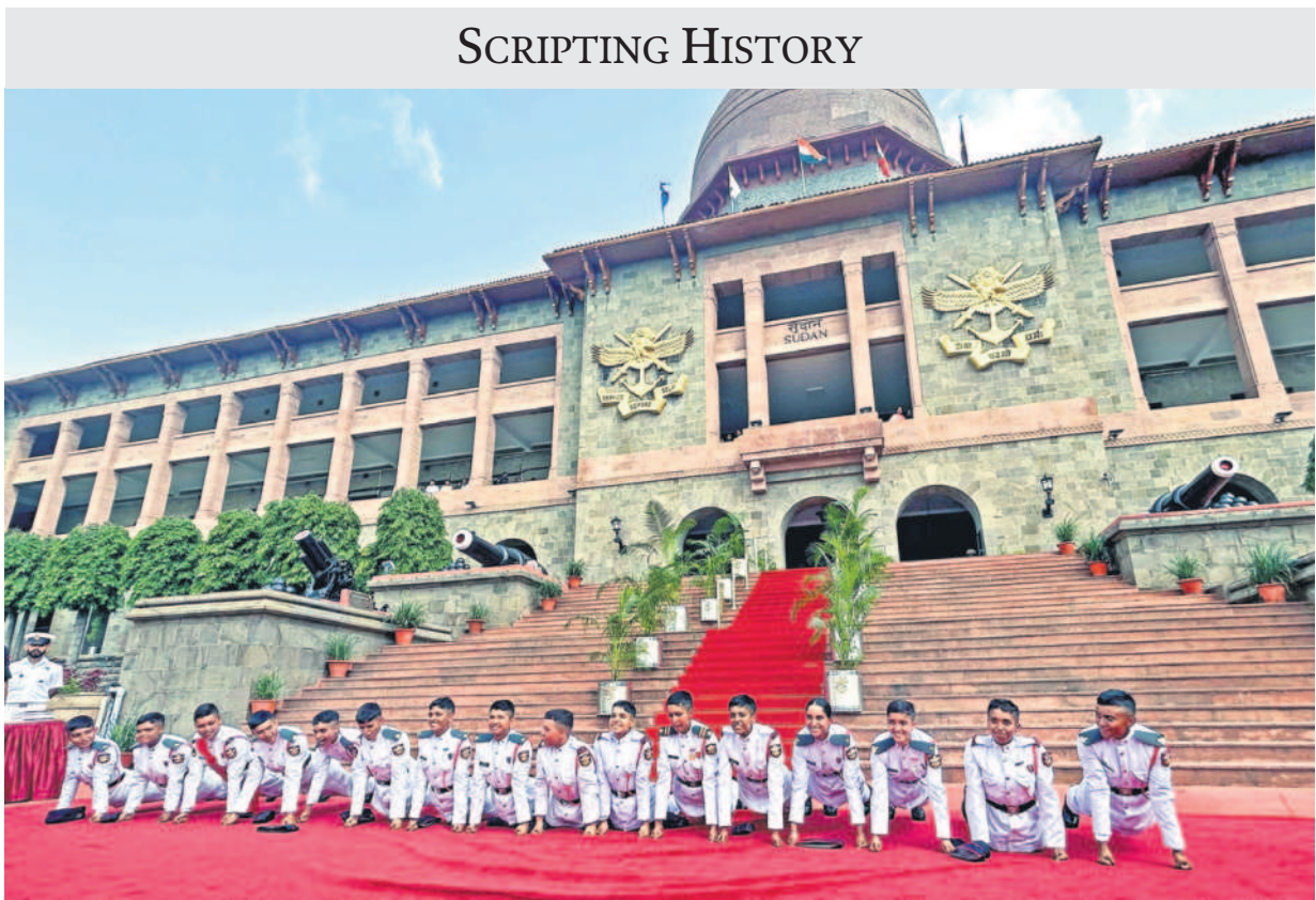
The first batch of women cadets perform push-ups during the passing out parade of the 148th course of the National Defence Academy in Pune. The women graduated alongside over 300 male counterparts, marking the passing out of NDA's first co-ed batch.

Abdul Altaf (25), who is listed as a rowdy sheeter at the Mailardevpally police station in the Cyberabad Police Commissionerate, allegedly attacked the security personnel with a sharp object at a land-based casino operated at a star hotel in Panaji, Goa. (SEE PAGE 2)