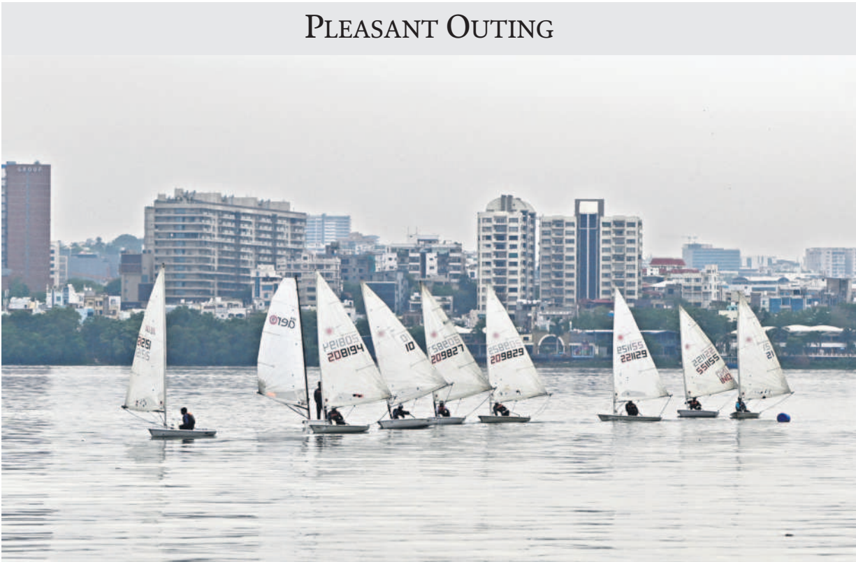
Sailors practising at the Hussain Sagar in Tank Bund on a pleasant Wednesday evening.

WELCOMES STRONG REBUTTAL BY L&T; BLASTS CONG, BJP FOR INDULGING IN CHEAP POLITICS