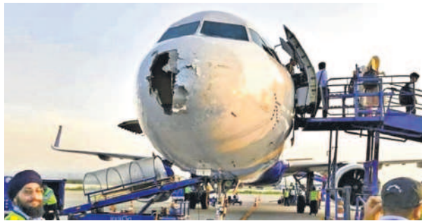
The damaged nose of the IndiGo aircraft that landed in Srinagar.

India's civil aviation regulator, the DGCA, said the aircraft was cruising at an altitude of approximately 36,000 feet near Punjab's Pathankot when it ran into a thunderstorm and hailstorm. Experiencing severe