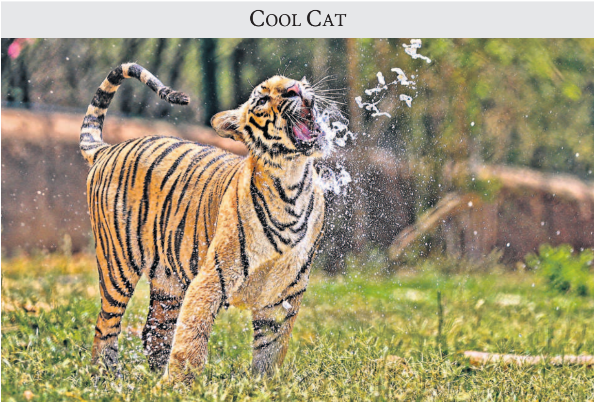
Bengal tiger Skandi plays with a water sprinkler inside its enclosure, at Nahargarh Biological Park in Jaipur on Friday.

The board also discussed the working of the Reserve Bank during the year April 2024-March 2025 and approved the Reserve Bank's Annual Report and Financial Statements for the year 2024-25. The transferable surplus for the year (2024-25) has been arrived at on the basis of the revised ECF. PTI