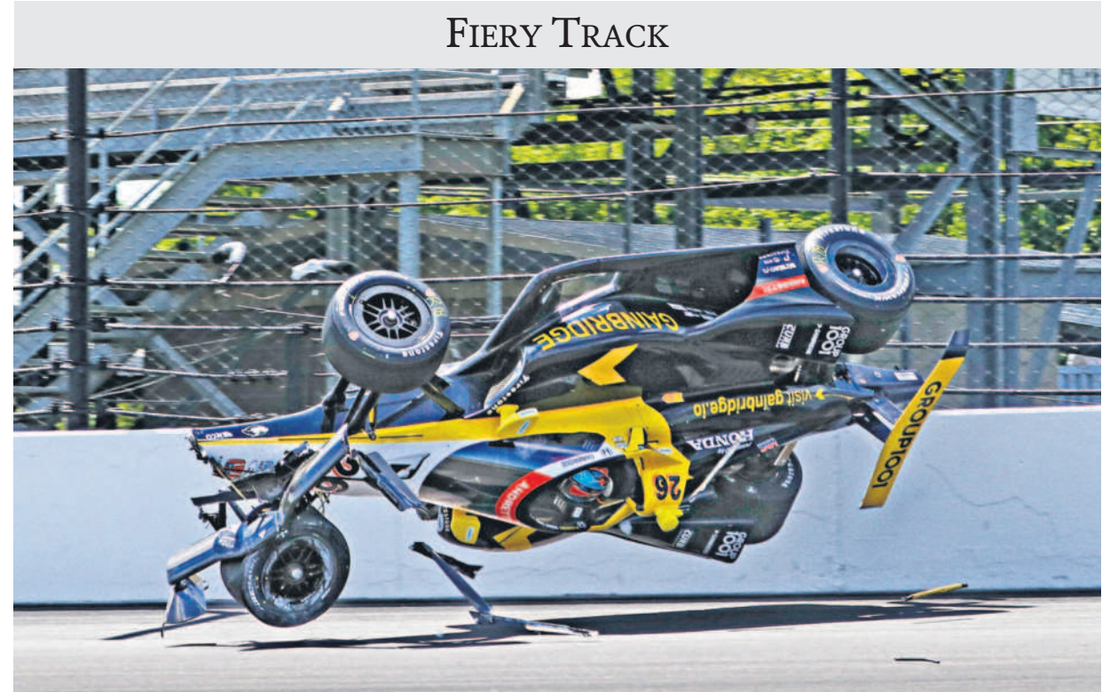
A car goes airborne after hitting the wall in the first turn during a qualification attempt for the Indianapolis 500 auto race at Indianapolis Motor Speedway in the US on Saturday.