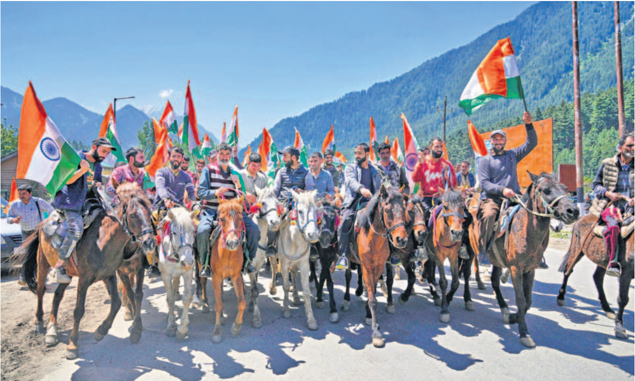
Hoteliers, pony riders and tour guides carrying the Tricolour during a Tiranga Yatra in Pahalgam, J&K, on Thursday.

"To me things are fairly clear. So, let me take this opportunity to spell out our position. One, where Pakistan is concerned, our relations, our dealings with them will be bilateral, and strictly bilateral. That is a national consensus for many years, and there is absolutely no change in that consensus that dealings with Pakistan will be bilat-