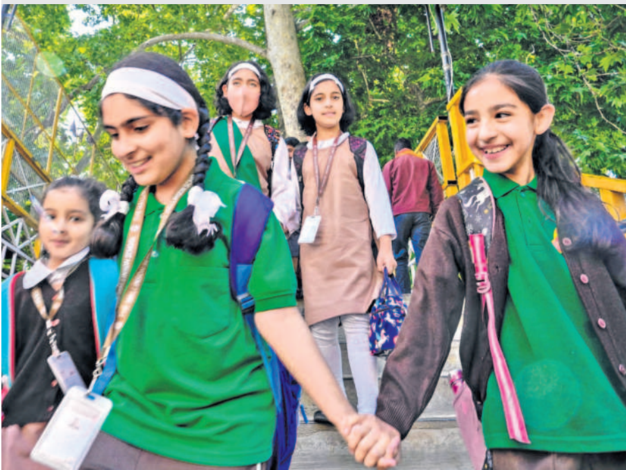
Life in Srinagar city and elsewhere in the Kashmir Valley returned to normal as schools, colleges, universities, markets, transport, and other businesses started functioning normally on Tuesday after India-Pakistan tensions, in Srinagar, on Tuesday. Except for schools in border areas, educational institutions across the region functioned normally.