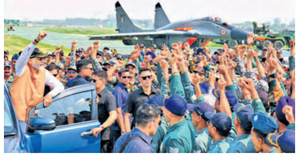
Prime Minister Narendra Modi greets Indian Air Force officers at Adampur on Tuesday.

"Aatank ke viruddh Bharat ki Lakshman Rekha ekdam spast hai. Ab phir koi terror attack hua to Bharat jawab dega, pakka jawab dega. (India's Lakshman Rekha against terrorism is now crystal clear. India will respond and definitely respond if hit by a terror attack)," he said, in an over 27-minute speech which echoed the message of his address to the nation on Monday night. But the significance of the speech was immense. It was delivered from the Adampur base, merely 100 km from the Pakistan border, which Pakistan claimed to have destroyed along with the S-400 missile defence system. India had rubbished the claims and TV cameras following Modi corroborated that. (SEE PAGE 2)