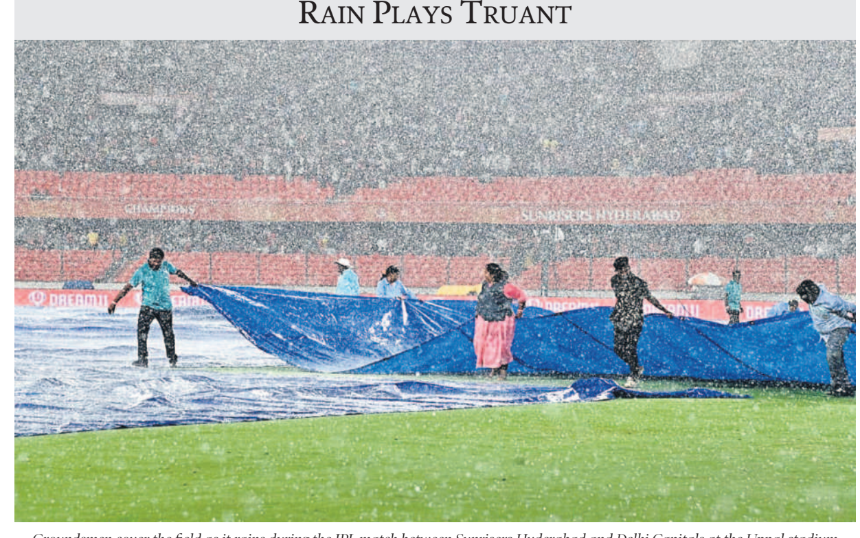
Groundsmen cover the field as it rains during the IPL match between Sunrisers Hyderabad and Delhi Capitals at the Uppal stadium on Monday. SRH has been eliminated from the race for a place in the playoffs. (REPORT PAGE 10)

While the Assembly passed Bills seeking 42 per cent BC quota in local bodies, education, and employment, they are still pending for the Central government's approval.