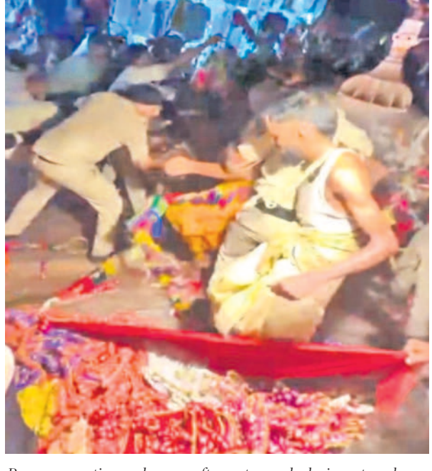
Rescue operation under way after a stampede during a temple festival in North Goa on Saturday.

About 50 people fell on the slope, and the stampede