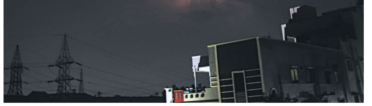
A lightning bolt rips though the night sky in Hyderabad on Thursday as parts of the city witnessed thunderstorms and gusty winds, bringing respite from days of severe heat and humidity.

government said snows resilience of the Indian economy and the effectiveness of cooperative federalism. The gross GST mop-up was Rs 2.10 lakh crore in April 2024 - the second highest collection ever since GST was rolled out on July 1. 2017. The net mop-up was Rs 1.92 lakh crore. In March 2025, the collection was Rs 1.96 lakh crore. In a post on X, Finance Minister Nirmala Sitharaman expressed gratitude to the taxpayers. PTI