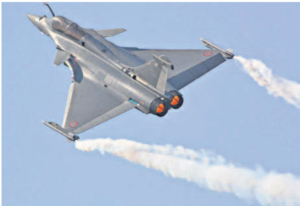
Manufactured by French defence major Dassault Aviation, the Rafale-Marine is a carrier-borne combat-ready aircraft.

India is procuring the jets for deployment on board aircraft carrier INS Vikrant. Manufactured by French defence major Dassault Aviation, the Rafale-Marine is a