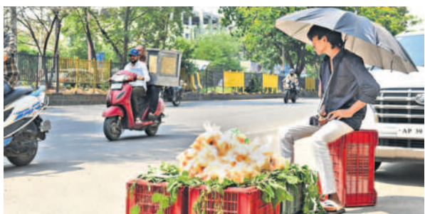
A vendor selling ice apples in Hyderabad.