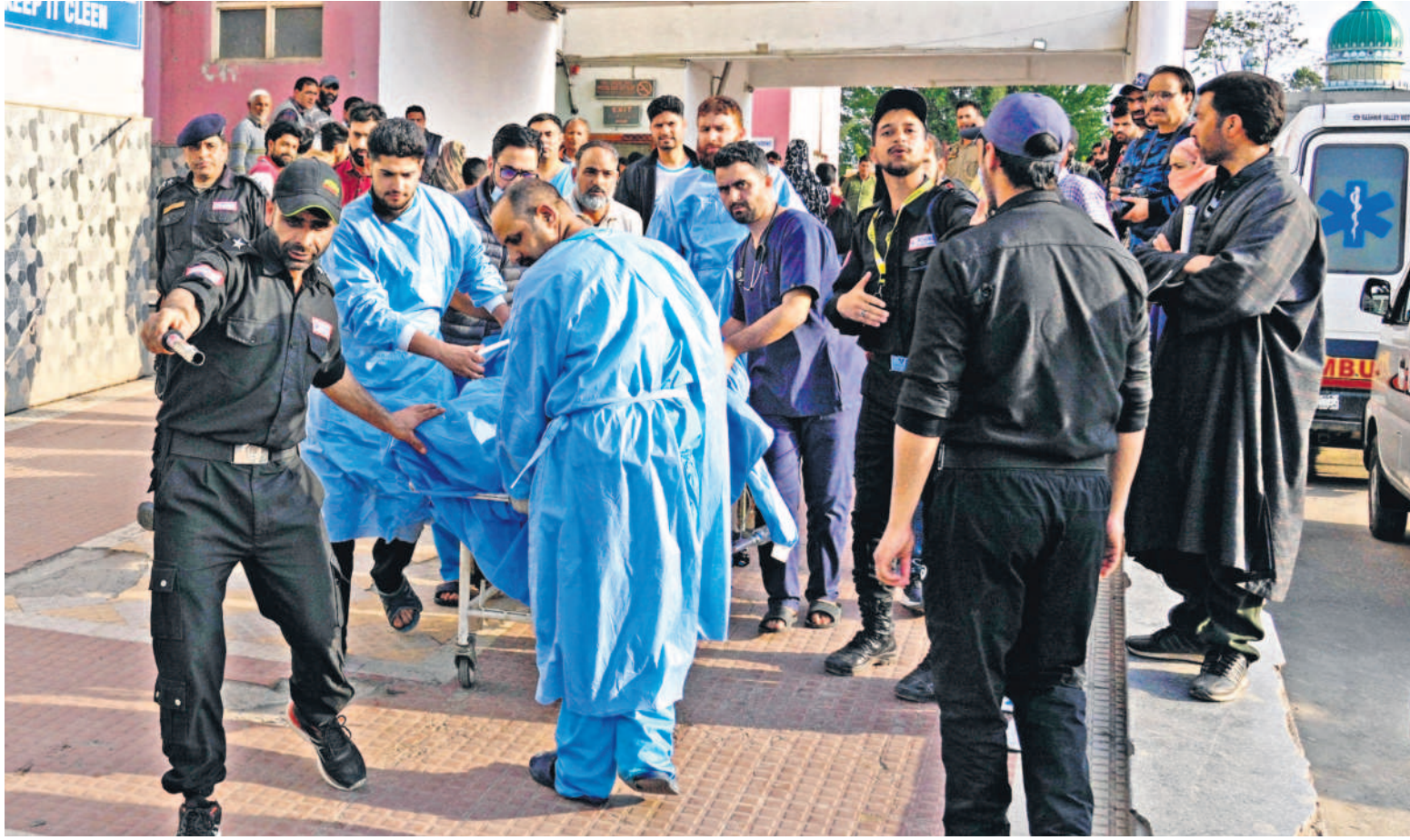
Paramedics carry a wounded tourist on a stretcher at a hospital in Anantnag after terrorists fired at tourists visiting Pahalgam on Tuesday.

As news of the terror attack targeting tourists in Kashmir town spread, The