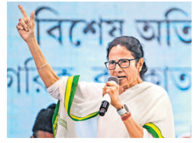
West Bengal Chief Minister Mamata Banerjee speaks during a meeting in Kolkata on Wednesday.

tral government can't evade responsibility," she said. PTI