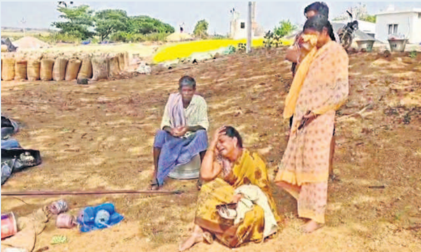
A woman is inconsolable after rains damaged paddy at a procurement centre in Khammam.