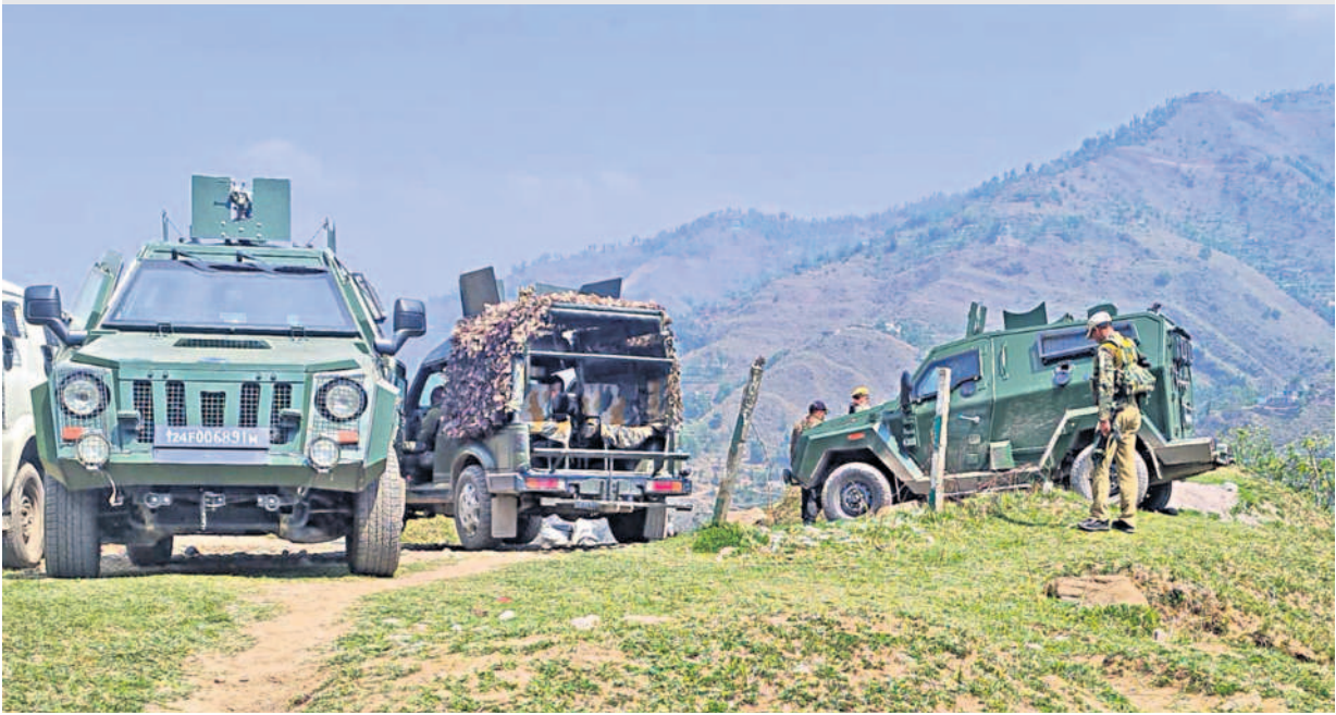
Security personnel keep vigil after a brief exchange of fire between terrorists and security forces in Lasana village of Surankote in Jammu and Kashmir's Poonch district on Tuesday.