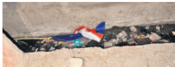
A flag of Dr Ambedkar dumped in a drain at Pippiri village in Bazarhathnoor mandal on Monday.

ADILABAD: Unidentified persons dumped flags of Dr BR Ambedkar in a roadside drain at Pippiri village in Bazarhathnoor mandal on Monday, insulting the leader on his birth anniversary. Police said that certain unidentified persons had thrown the flags in a drain causing disgrace to Ambedkar and creating a flutter in the village. They stated that a case was registered and investigations were taken up. The police added that they were scanning footages from CCTV cameras installed in different parts of the village to detect the offenders. Locals demanded the police initiate stern action against the perpetrators by probing the incident.