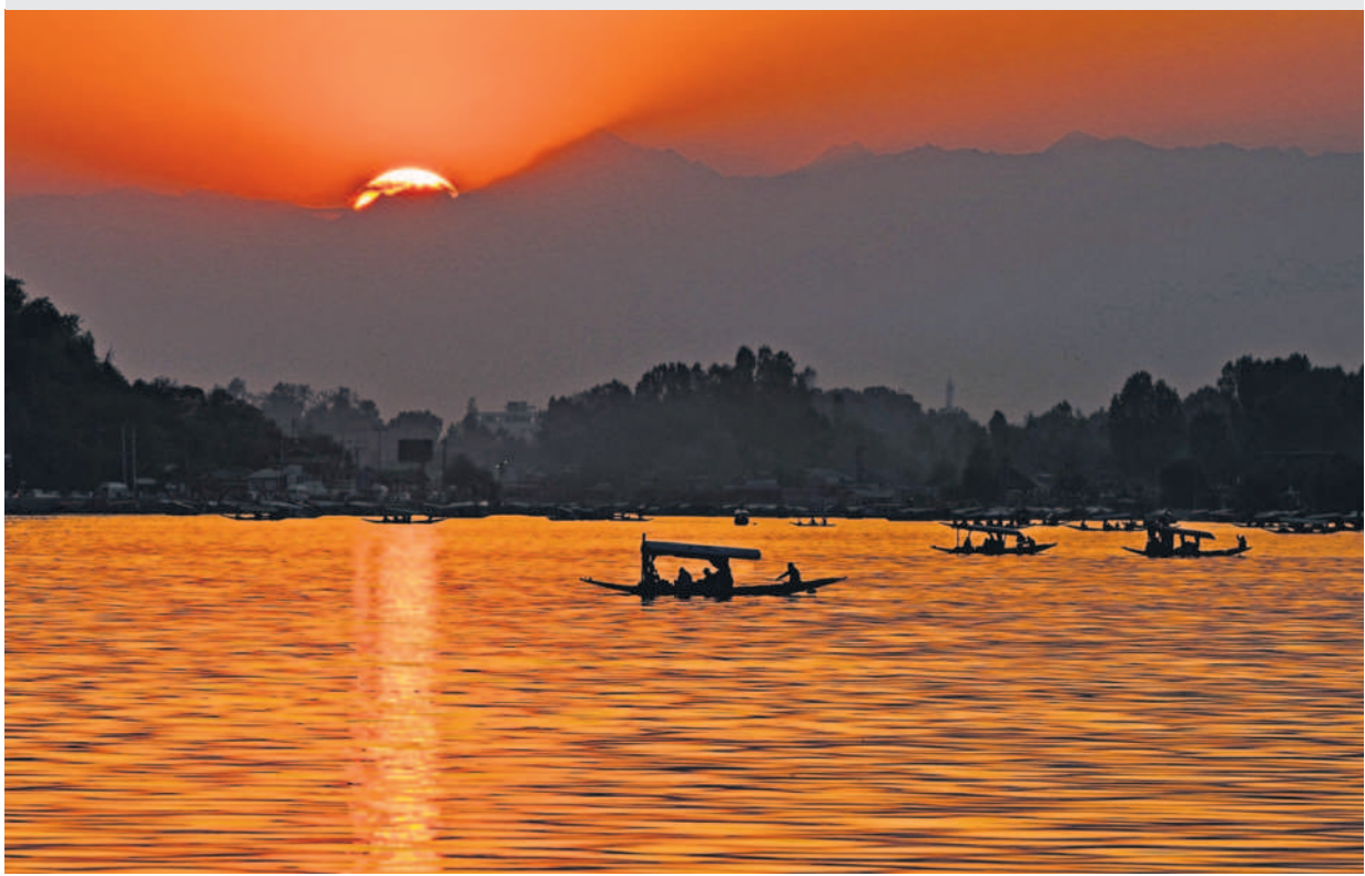
Tourists taking a shikara ride are silhouetted against the setting sun at the Dal Lake in Srinagar on Monday.