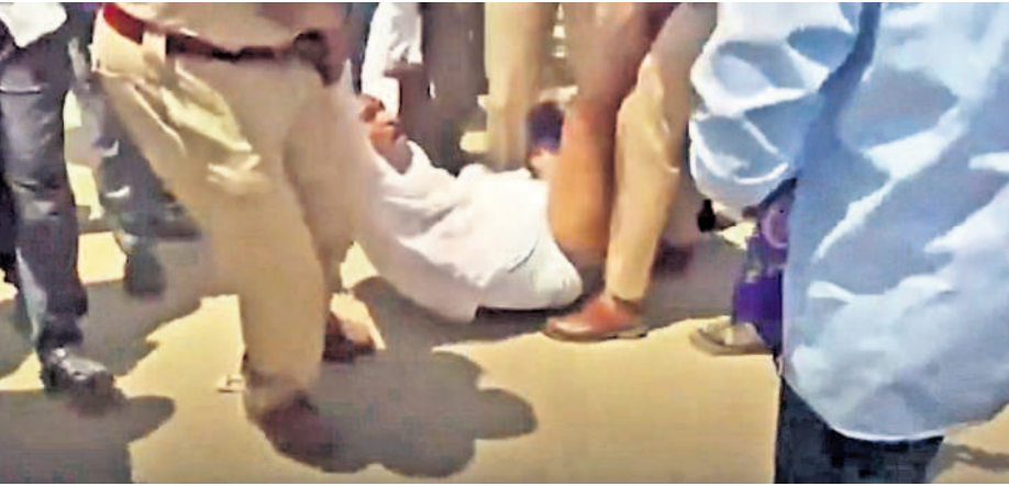
Video grab of a Dalit man being dragged by the police in Lingampet mandal of Kamareddy.

“Just Another Day in Mohabbat Ka Dukaan! A Dalit man was stripped and arrested right under Babasaheb's shadow on his birth anniversary in Congress ruled Telangana! I demand to know how is tying a banner for Ambedkar Jayanthi a crime so heinous that this