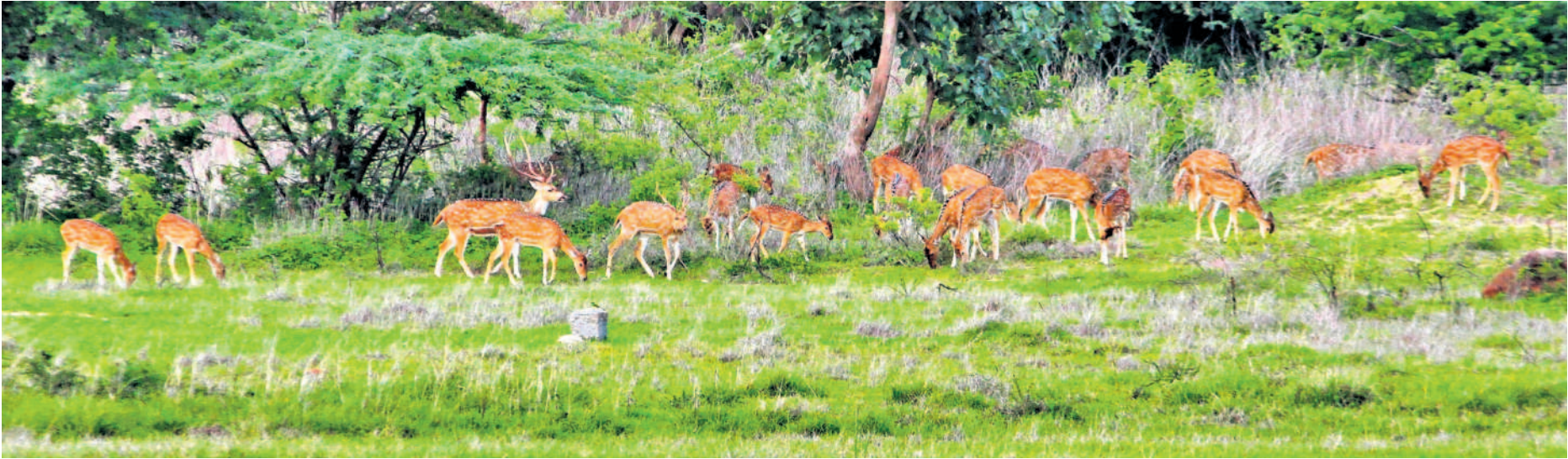
Kancharla Gachibowli is home to over 72 tree species, including rare ones such as Marking Nut Tree, over 230 species of birds and 32 reptiles.

Separately, the Government of India is a signatory of the 9-Kyoto Protocol at