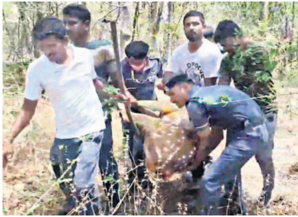
The injured deer being shifted for treatment to a veterinary hospital where it eventually succumbed to injuries.