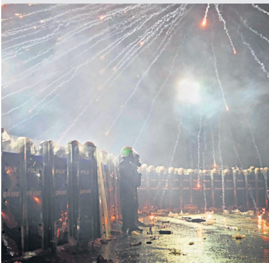
Fireworks thrown by protesters explode over riot police during a protest after Istanbul's Mayor Ekrem Imamoglu was arrested and sent to prison, in Istanbul, Turkiye.