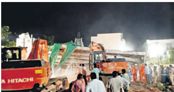
Rescue operations under way at the collapsed building site in Bhadrachalam town on Wednesday.

District Collector Jitesh V Patil, Superintendent of Po-