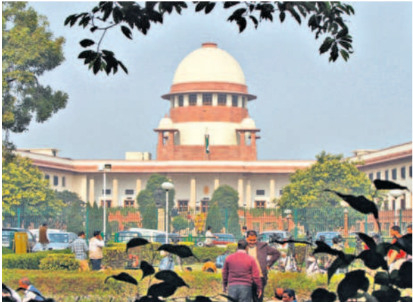
The Supreme Court took up the disqualification petitions against 10 MLAs who defected from the BRS to Congress, on Tuesday.