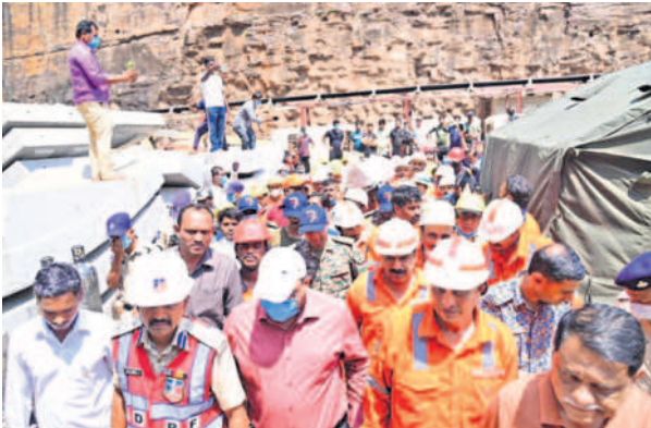
Rescue personnel recovered one more body from the Srisailem Left Bank Canal tunnel collapse site, on Tuesday.

Rescue teams acted swiftly to retrieve the body and transported it to the Nagarkurnool Government Hospital for further procedures, including a post-mortem. Officials later iden-