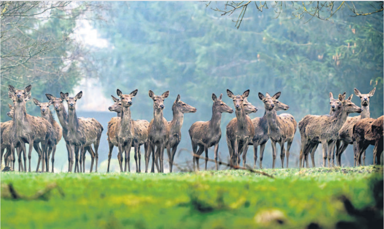
Deer gather on a glade in a forest of the Taunus region near Frankfurt, Germany on Tuesday.