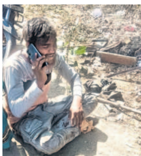
A man who was injured in the road accident.

Two other family members, including Chauhan's