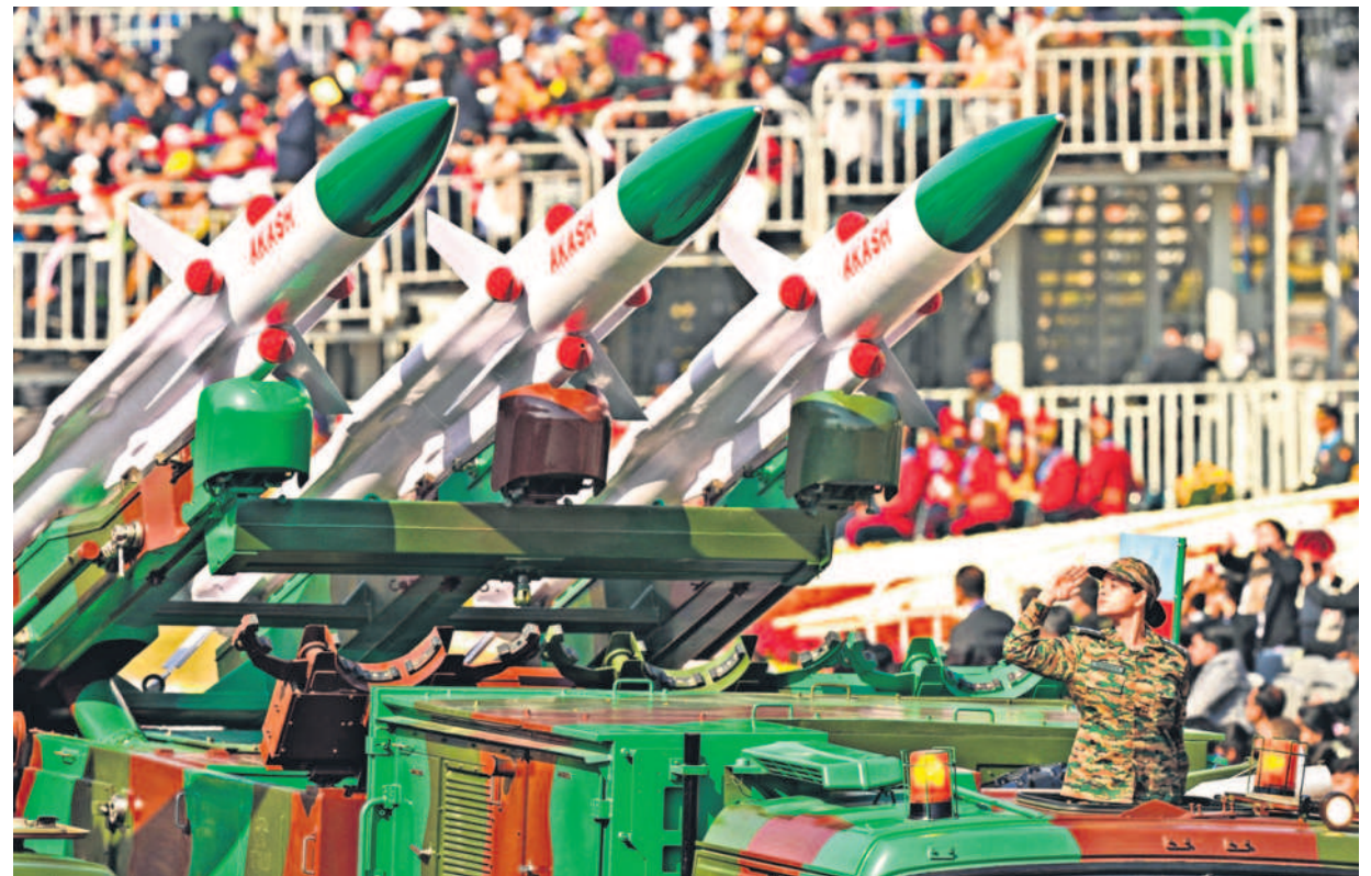
Akash Army Launcher on display during the 76th Republic Day parade at the Kartavya Path in New Delhi on Sunday.

Rafale's victory roll, Sukhoi-30's 'Trishul' act show stoppers