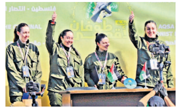
Israeli women soldier hostages wave at a crowd before being handed over to the Red Cross in Gaza City.

The four Israeli soldiers smiled broadly as they waved and gave the thumbsup from a stage in Gaza City's Palestine Square, militants on either side of them and a crowd of thousands watching before they were led off to waiting Red Cross vehicles. They were likely acting under duress, with previously released hostages saying they were held in brutal conditions