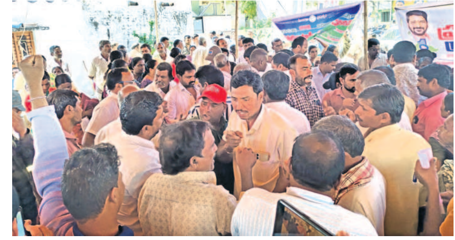
People argue with officials at a Gram Sabha in Mahabubnagar on Thursday.