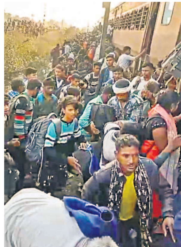
People gather at the site following the death of the train passengers in north Maharashtra's Jalgaon district.

Train No. 12627, Bengaluru-New Delhi Karnataka Express hit people standing on the railway tracks, he added. "Six to