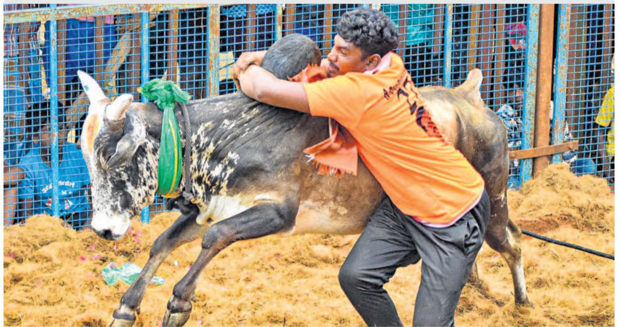
A bullfighter tries to tame a bull during a Jallikattu competition in Trichy, Tamil Nadu, on Saturday.