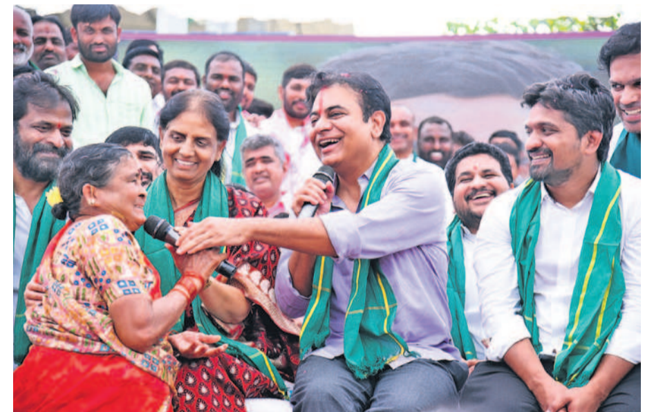
BRS working president KT Rama Rao during the Rythu Maha Dharna at Shabad of Chevella constituency in Rangareddy district on Friday.

KTR throws challenge at Congress government