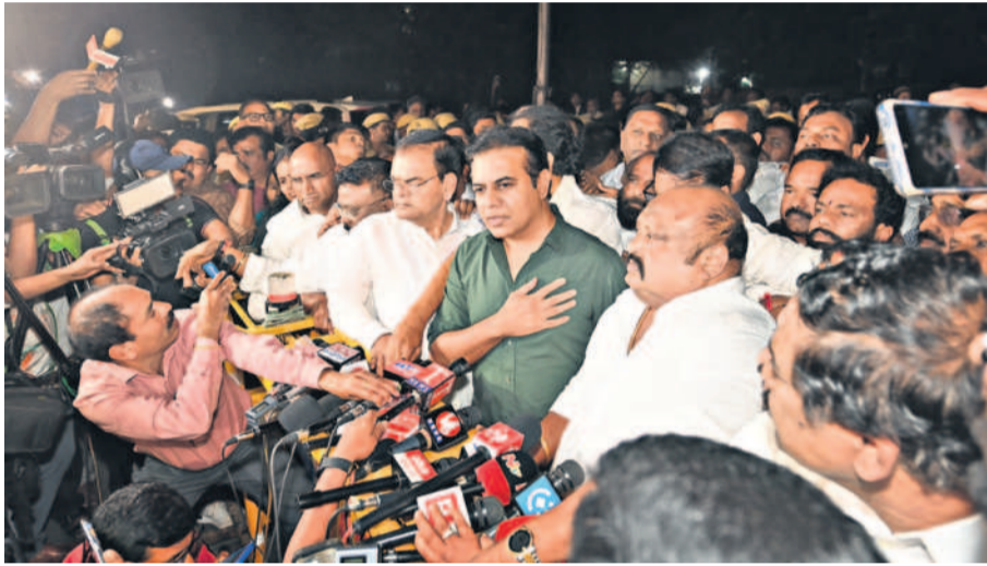
BRS working president addressing media persons after a seven-hour marathon questioning by the Enforcement Directorate, in Hyderabad on Wednesday.

"I have a Sankranti offer to Revanth Reddy. Let us un-