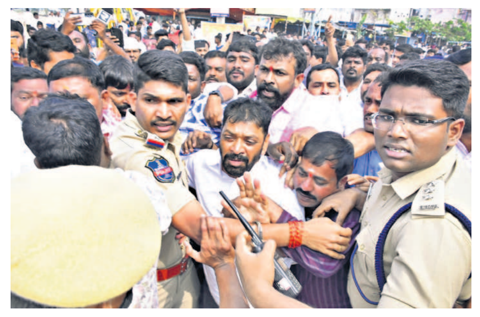
Police officials arrest a BRS leader during the protest at Bhongir on Sunday.