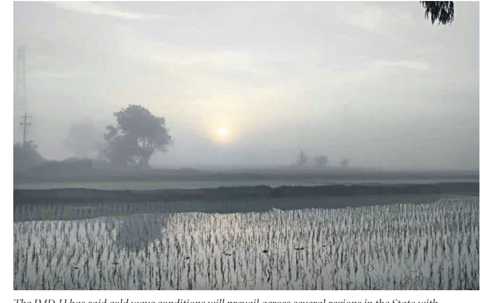
The IMD-H has said cold wave conditions will prevail across several regions in the State with minimum temperatures hovering between 2 degrees C and 4 degrees C.

"Mist or hazy conditions are very likely to prevail in the morning hours at isolated pockets over Telangana during the next five days. The minimum temperatures are likely to be below by 2 degrees C to 4 degrees C during the next three