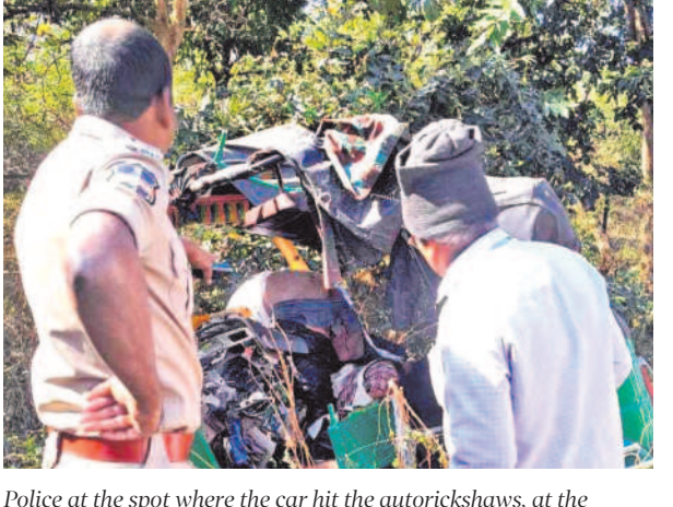
Police at the spot where the car hit the autorickshaws, at the Nallavally forest area in Sangareddy district on Friday.

Due to the high intensity of the collision, the passengers of the two autos were thrown out of the vehicles