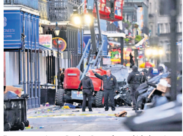
Emergency services on Bourbon Street after a vehicle drove into a crowd on New Orleans Canal and Bourbon Street.

New Orleans Mayor La-Toya Cantrell described the killings as a "terrorist attack" and the city's police chief said the act was clearly intentional. Police Commissioner Anne Kirkpatrick