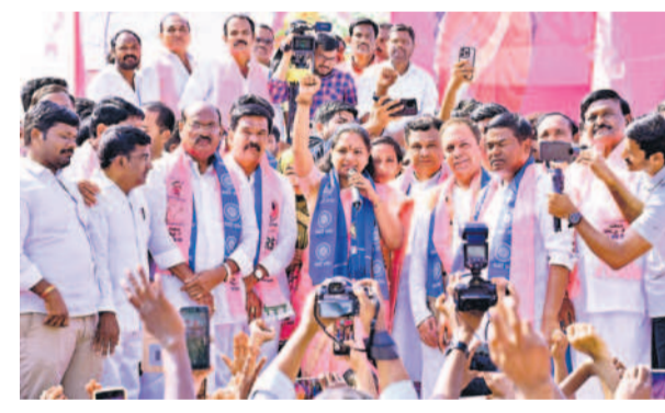
BRS MLC K Kavitha with party leaders and Telangana Jagruthi representatives in Nizamabad on Sunday.

"No matter how many cases or arrests come our way, we will stand firm," she declared, addressing a massive gathering at Nizamabad on Sunday. On her first visit to the erstwhile Nizamabad district after being released in the Delhi excise policy case, she received a grand welcome from BRS leaders