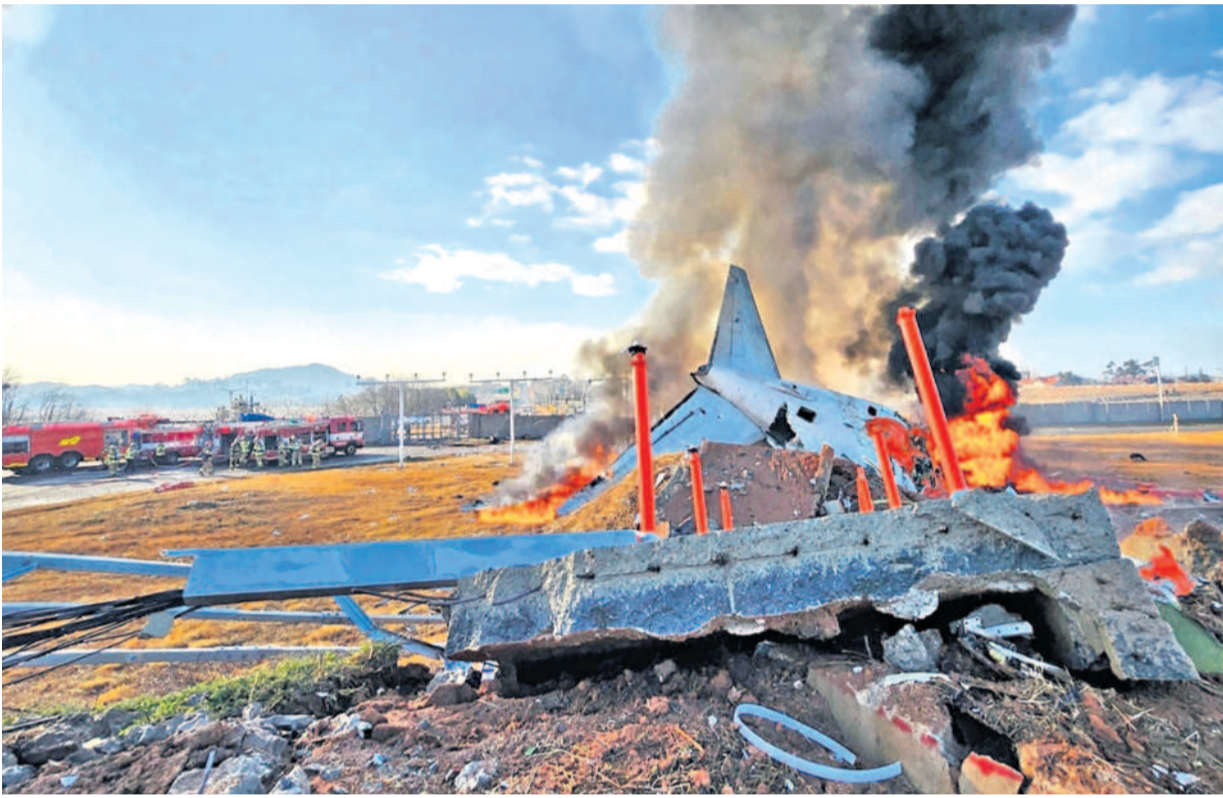
The passenger plane in flames at the Muan International Airport in Muan, South Korea, on Sunday.

The fire agency deployed 32 fire trucks and several helicopters to contain the