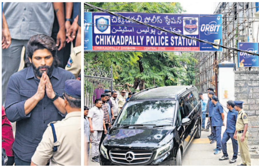
Allu Arjun at the Chikkadpally police station for questioning as part of an ongoing probe into the stampede case.

Allu Arjun reportedly faced a volley of questions over the stampede at the theatre, which resulted in the death of a woman and serious injuries to her son. He was reportedly confronted and questioned, showing a 10-minute video that detailed the happening on the fateful day in the theatre. After over three and half hours of questions, the