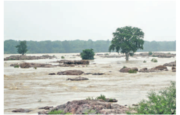
Nearly 44 lakh people in 10 districts of Madhya Pradesh and 21 lakh in Uttar Pradesh will get drinking water under the project.

Nearly 7.18 lakh farmer families of 2,000 villages will benefit from the project, which will also generate 103 MW of hydropower and 27 MW of solar energy, he said. "Prime Minister Modi is coming to Khajuraho in Chhatarpur district on December 25 to lay the foundation of this project which will change the image and destiny of Bundelkhand in Madhya Pradesh and Uttar