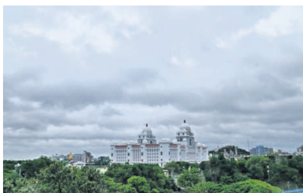
According to IMD, the chances of drizzle, sporadic showers and cloudy skies are also likely in the districts.

The forecast looked at the likelihood of generally cloudy sky, mist or hazy conditions during mornings and likely light rain/drizzle. Forecasting similar conditions State-wide, the IMD said the minimum temperatures are likely to be above normal by 20 degrees Cel-