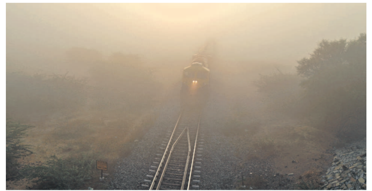
A train makes its way amid dense fog in Alampur of Jogulamba Gadwal district on Sunday morning.

By the early hours of Sunday, the minimum temperature at several locations in Adilabad and Kumram Bheem Asifabad districts anywhere hovered between 6.3 degrees Celsius and 7 degrees Celsius. Hyderabad and its neighbouring districts were also under the grip of intense chilly weather conditions, with the BHEL area in Sangareddy district recording single-digit temperature at 9.6 degrees Celsius. The lowest minimum temperature of 6.3 degrees Celsius was recorded at