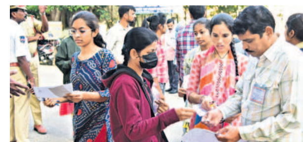
A candidate at an examination centre in Hyderabad on Sunday.

Several aspirants who appeared for the Group-II services examination were taken aback seeing the names of Cillian Murphy, Emma Stone, and Christopher Nolan in one of the first ten questions. The examination conducted for recruitment to posts, including Municipal Commissioner, Assistant Commercial Tax Officer and Naib Tahsildar, tested the candidate's Oscar knowl-