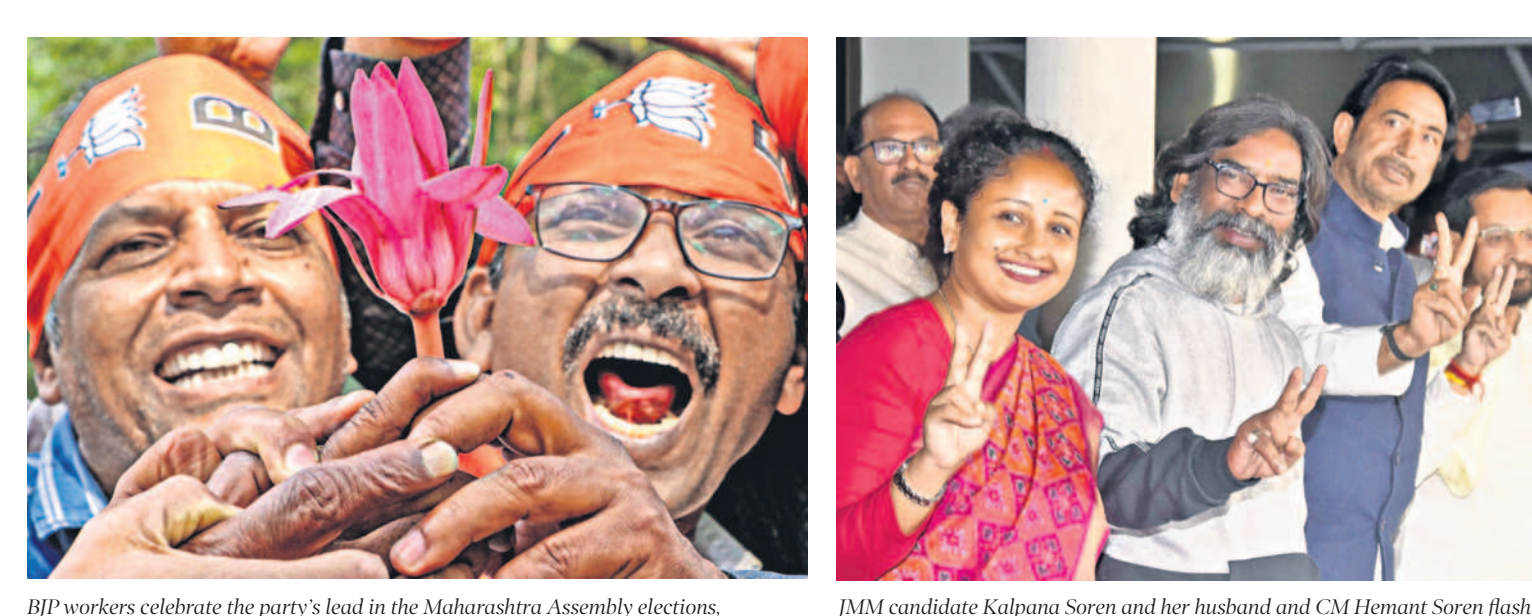
BJP workers celebrate the party's lead in the Maharashtra Assembly elections, in Nagpur on Saturday.