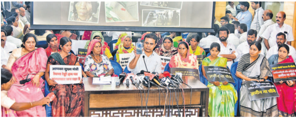
BRS working president KT Rama Rao, accompanied by tribal women from Lagacherla, addressing a press conference in New Delhi.

Rama Rao said the Congress government was forcefully acquiring 3,000 acres in Dudyal mandal to establish a Pharma Village by offering Rs 8-10 lakh per