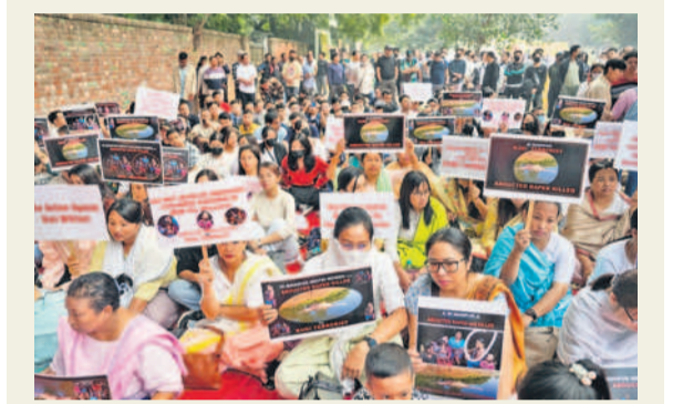
People stage a protest at Jantar Mantar in New Delhi on Sunday.