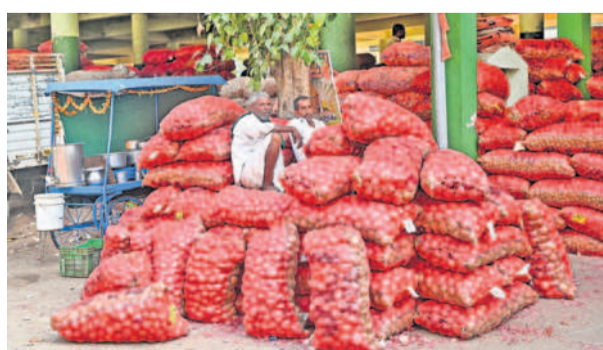
Traders attribute the price rise to low supplies from local regions of Telangana, Karnataka, AP and Maharashtra.

Traders in the wholesale market attribute the price rise to low supplies from local regions of Telangana, Karnataka, Andhra Pradesh and Maharashtra. A majority