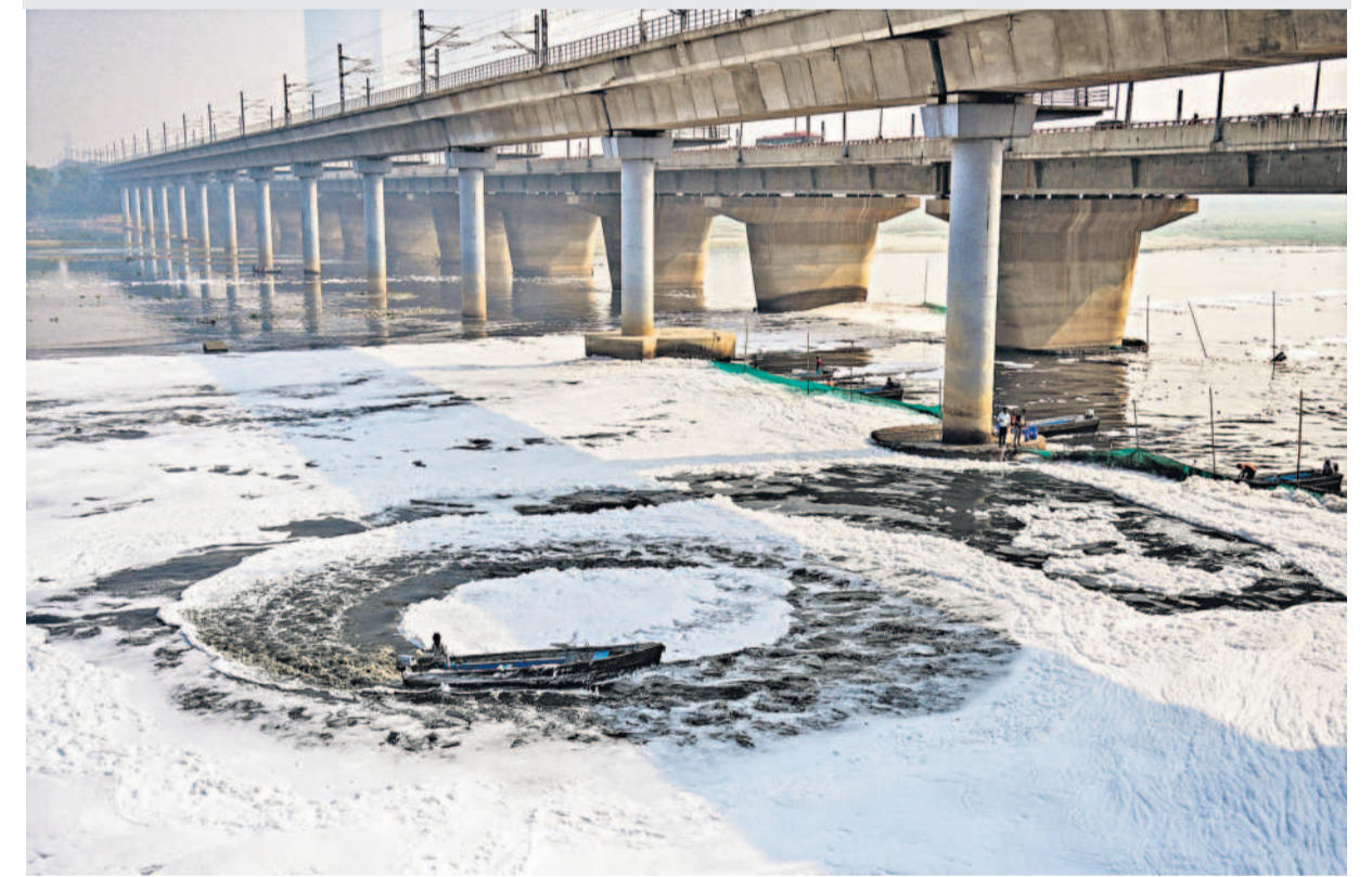
A Delhi Jal Board worker during the froth suppression drive at the Yamuna river to check its pollution, in New Delhi.