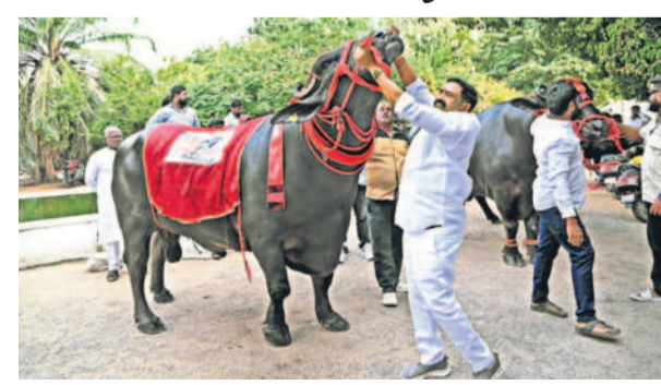
The champion buffalo bull from Haryana, a Murrah breed, weighs 1.8 tonnes and stands 7-ft tall.

VADODARA: Prime Minister Narendra Modi and Spanish PM Pedro Sanchez inaugurated the Tata Aircraft Complex in Vadodara, India's first private facility to build military planes, where C295 aircraft will be produced. Noting that the partnership between India and Spain is finding a new direction, Modi said the project would not only strengthen the relations between the two nations but also give momentum to the mission of 'Make in India, Make for the World'. Modi conveyed his best wishes to the team of Airbus and Tata, and also paid tributes to late Ratan Tata. PTI