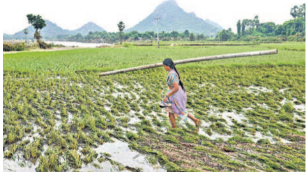
The State government has slashed the extent of crop loss due to rain from 4.15 lakh acres to a meagre 79,574 acres.

Chief Minister A Revanth Reddy had earlier revealed the preliminary estimates that around 1.53 lakh acres got damaged during the rain and assured farmers of support. Just three days ago, the