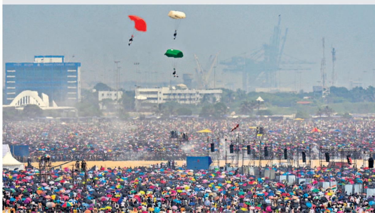
At least five persons, who were among thousands of spectators during the IAF air show at Marina Beach in Chennai, died of extreme exhaustion and other causes on Sunday. Several persons fainted and emergency workers carried them on stretchers and provided care in shelters.