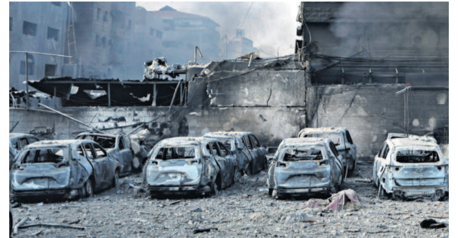
Charred cars at the site of an Israeli airstrike in Dahiyeh, Beirut, on Sunday.

Israel hits mosque sheltering displaced people