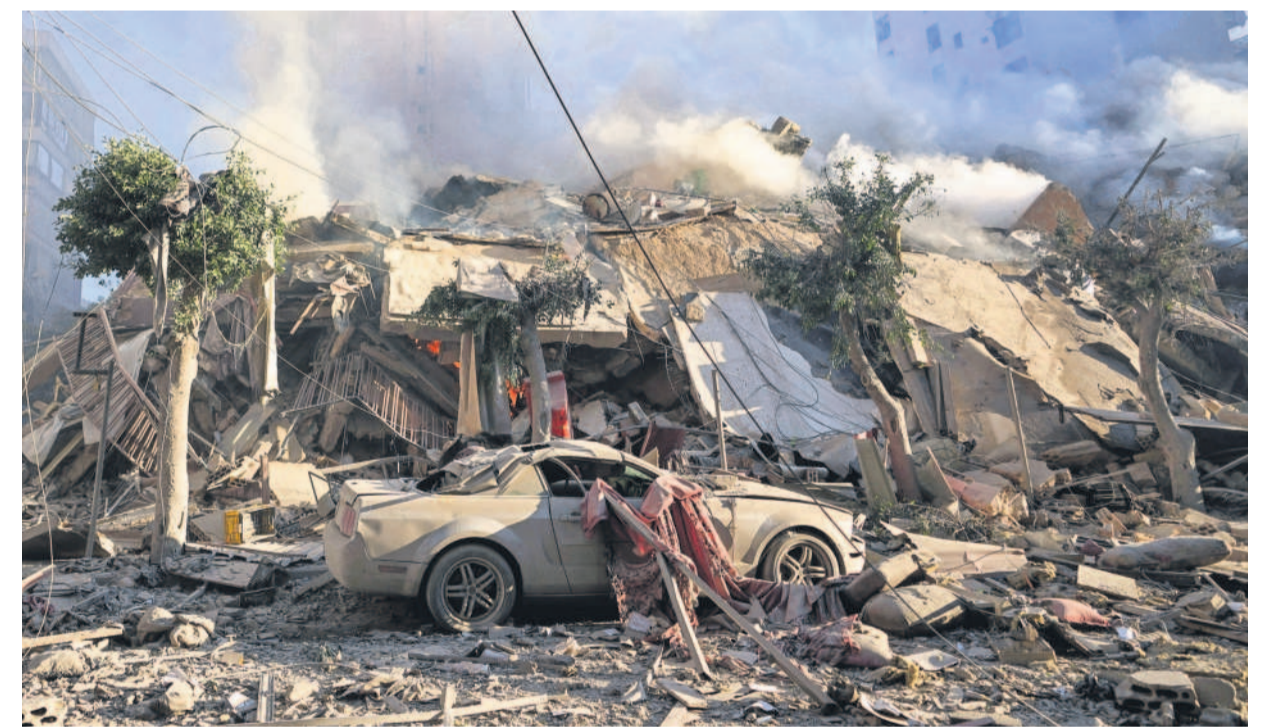
Smoke rises from the site of an Israeli airstrike in Dahiyeh, Beirut, Lebanon, on Thursday. (RELATED REPORTS PAGE 9)

The Israeli military has ordered the evacuation of villages and towns in south-