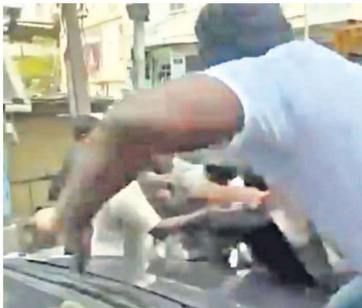
Congress workers jumping on top of a car and preventing BRS working president KT Rama Rao's convoy from moving forward, in Amberpet constituency on Tuesday.