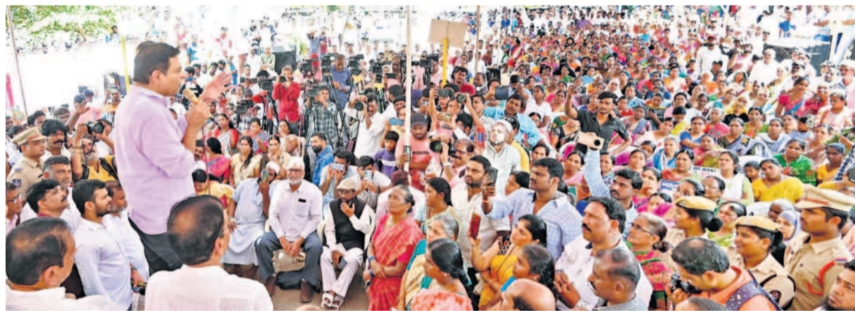
BRS working president KT Rama Rao interacting with the victims of Musi project, in Amberpet constituency on Tuesday.