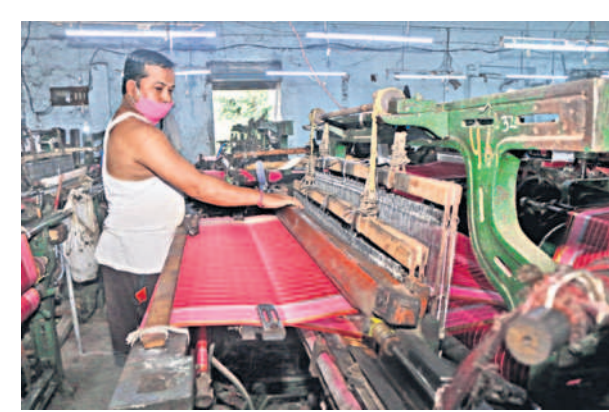
Though the CM said govt will distribute sarees to SHG members, he did not make it clear whether other women would also get them