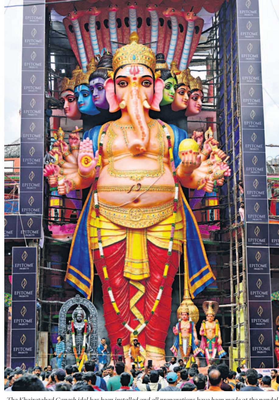
The Khairatabad Ganesh idol has been installed and all preparations have been made at the pandal for the Ganesh Chaturthi festival on Saturday. (REPORTS PAGE 3)