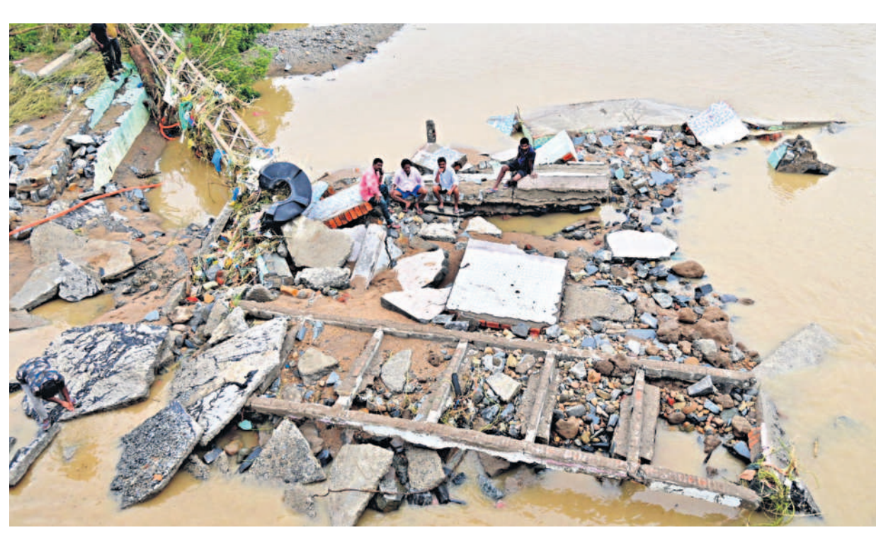
People sit on a structure which collapsed due to heavy rains that lashed the State, in Khammam on Monday.

tinued in some areas including Nirmal, caused inundation of low-lying areas, damage to agricultural crops and disruption of the State's rail and road links with the neighbouring Andhra Pradesh from Sunday. The situation did not see much improvement on Monday. At least 15 residential colonies in Khammam town remained underwater on Monday due to the overflowing Munneru River. More than 100 villages in Khammam district also remained submerged, according to reports. Of the nine persons who washed away in Khammam and Kothagudem, the body of one Yakub, who was washed away along with his wife at Nayakangudem Kusumanchi mandal in Palair, was found on Monday, but his wife Saida was not yet traced out. One body in Yerrupalem mandal, one in Bonakal in Khammam district, two dodies in Aswapuram mandal and one in Manugur mandal of Kothagudem district were found. The body of Nunavath Motilal, who washed away along with his daughter N Ashwini in their car, too was traced on Monday. The bod-