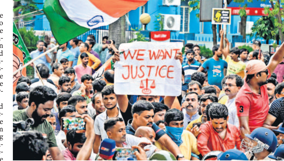
Protestors during a demonstration against the rape and murder of the doctor, in Kolkata.

The strong reprimand of the Kolkata Police by the top court in which a three-judge highlighted bench its "lapses" in its probe came even as Solicitor General Tushar Mehta, appearing for the CBI, said there was an attempt to cover up the case by the local police as the crime scene was "al-